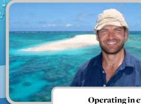
Operating in ever changing environments