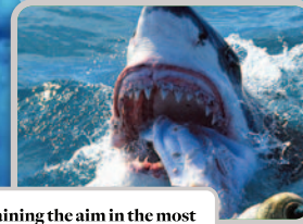
Maintaining the aim in the most demanding of circumstances